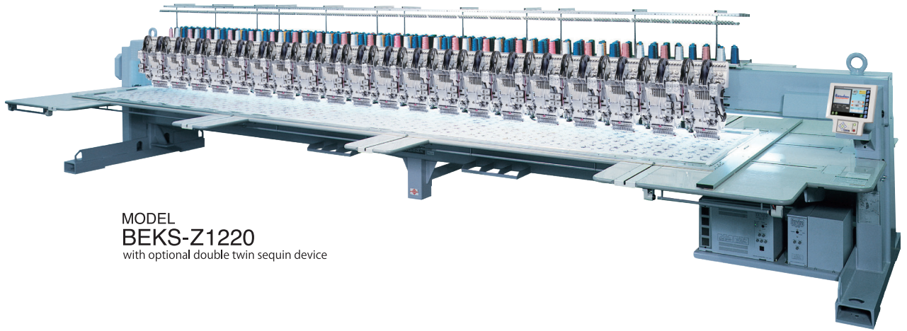
MODEL BEKS-Z1220 with optional double twin sequin device